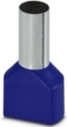
Ferrule, sleeve length: 16 mm, length: 31 mm, color: blue

Please be informed that the data shown in this PDF Document is generated from our Online Catalog. Please find the complete data in the user's documentation. Our General Terms of Use for Downloads are valid ( http://phoenixcontact.com/download )